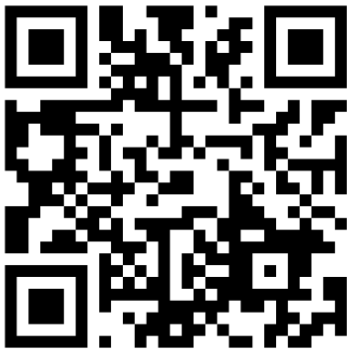
Scan the QR code to reach our website!